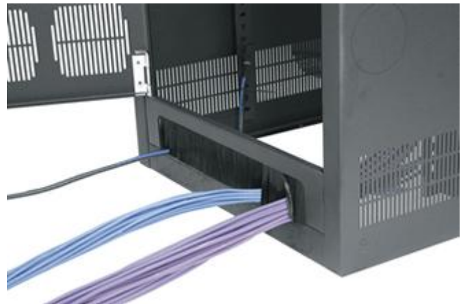
Cable Entry Rear Door