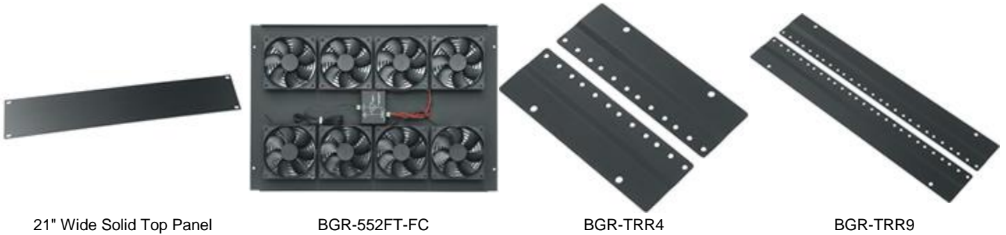
21" Wide Solid Top Panel