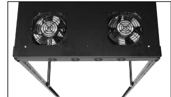
top shown with optional 5-FAN-K fan kit