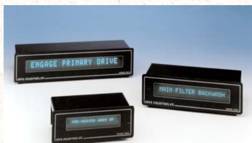
2000 Series Family Photo

Call Today! 1-888-DISPLAYS 1-888-347-7529