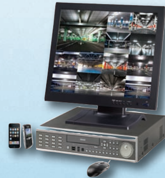
ZM-L Series now includes HDMI input to maximize resolution with DIGIMASTER H.264 DVRs.