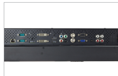
Multiple video inputs (VGA, DVI, HDMI, BNC, S-Video, DisplayPort and Component) allow for effortless system integration